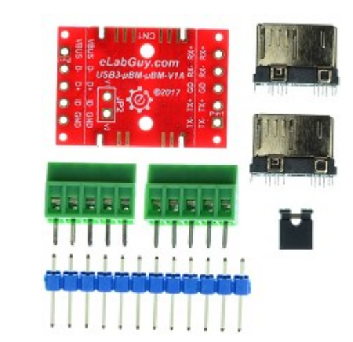
Figure 1: Parts inside the kit (Note: the module is not assembled, user can decide which connector to use on the module.)