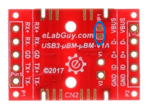
Figure 6: PCB back with optional Jumper connects Shield to GND