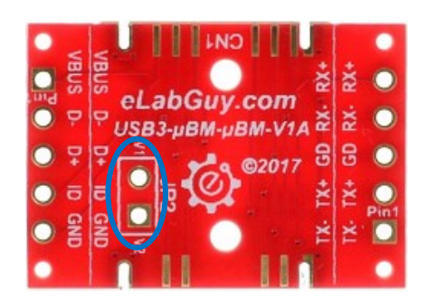
Figure 5: PCB front with open circuit on VCC pin in series